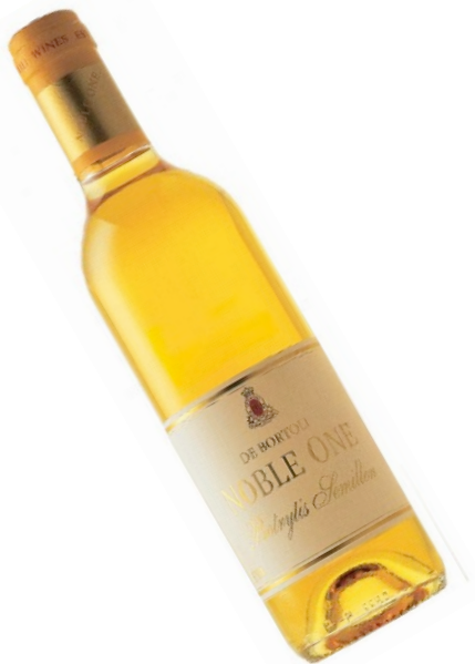
DeBortoli - The Noble One

The puff pastry with feta, mozzarella & roasted red pepper along with the mushroom leek tartlettes were a hit on